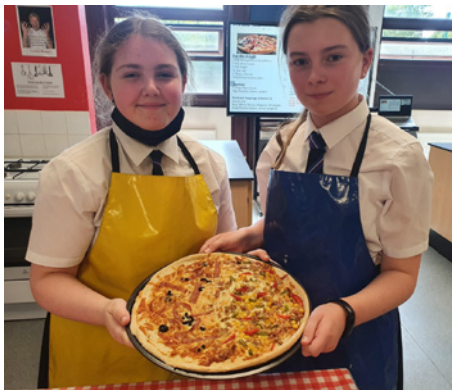
Two lovely Year 8 students showing their half and half pizza. They were 'Chefs of the lesson' as they followed the recipe independently and made a perfect pizza.